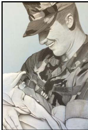
Grace Liberatore, First Sight , Charcoal